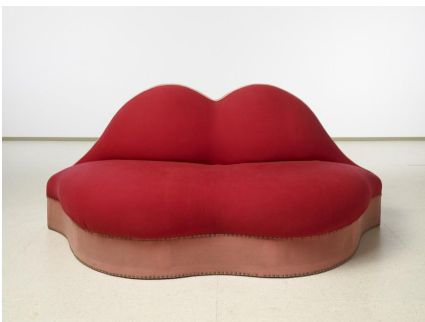
Lips Sofa - Dali 1931

He died anyway, at the age of 84. The Dali mystery - was it the Camembert cheese or Gala's poison?