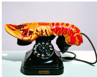
Lobster Phone - Dali 1937