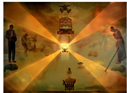
Perpignan Station - Dali 1965